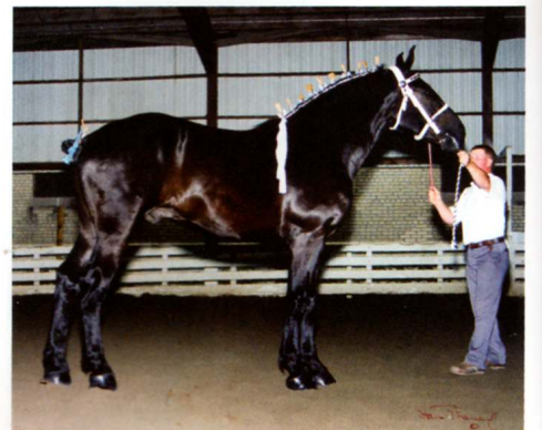
Pennwoods Derrick 274011, at the New York State Fair.

It is important for us to share the knowledge we have gained over the years from many great horsemen in the industry, some of which are no longer with us. We were fortunate enough to have many teachers that shared their love of draft horses with us. Therefore, we feel that it is our duty to continue the promotion of draft horses no matter what the breed. This year we had four youth showmen who we took to the horse shows with us. We pride ourselves in