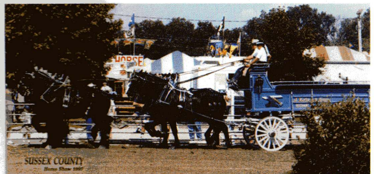
Brian and Stacie showing for Timmy Kriz 1997 Sussex County Horse Show.