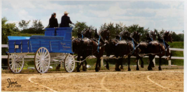
Our new hitch wagons debut at the 2008 Addison County Fair, Addison, Vermont.