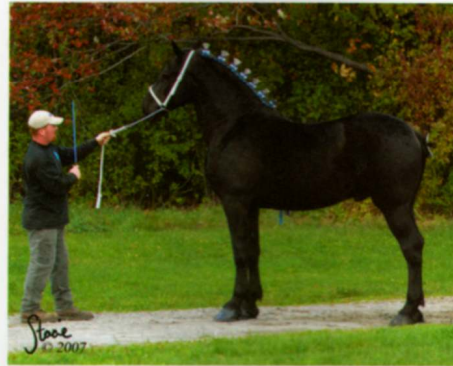
F.C. FOSTER 298100, 2007 reserve All-American 2 yr. old stallion.