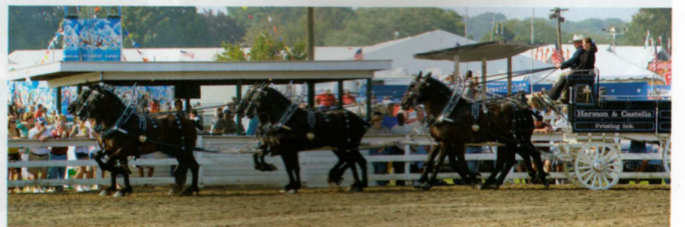
2008 Dutchess County Fair, Rhinebeck, New York.