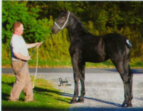
UTOPIA'S CRACKER JACK SURPRISE 304361.