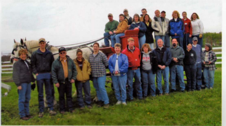
The 2003 PHA Education and Charitable Fund combined Adult and Youth Clinic, held at Fredericktown, Ohio.