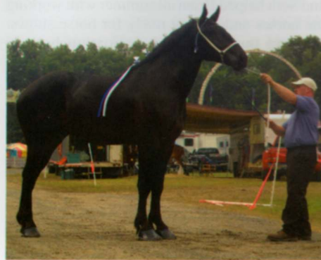
SOLID ROCK BILL 298200, photo by Stacie C. Lynch.