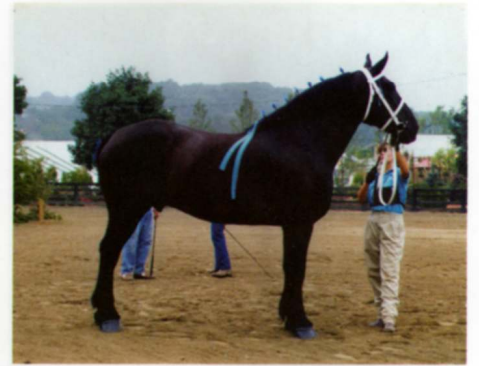
Stacie showing Prince in Sussex, New Jersey.